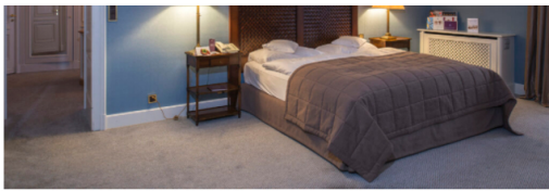
Suite Coco Chanel

GTS: Who are the other celebrities to have stayed at the Palace?